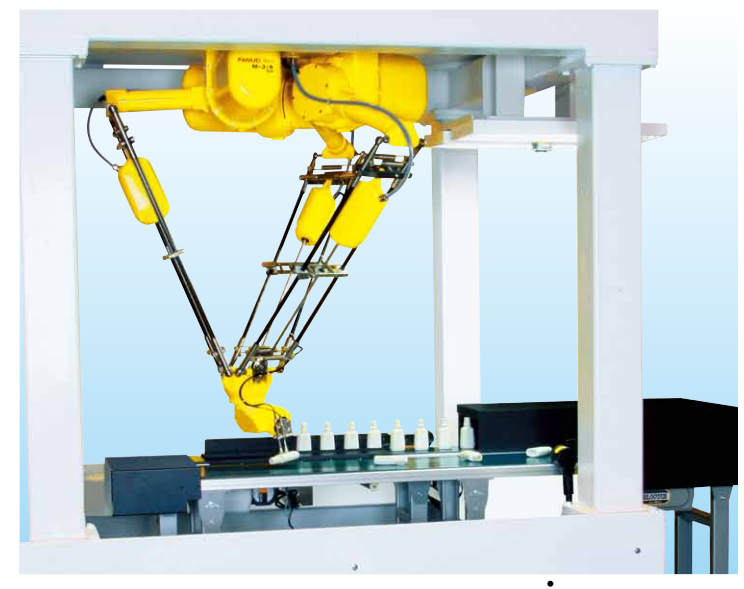
Standing the bottles by M-3 i A/6A