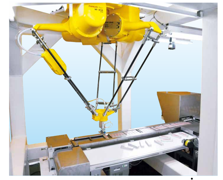
High speed arranging the foods by M-31A/6S